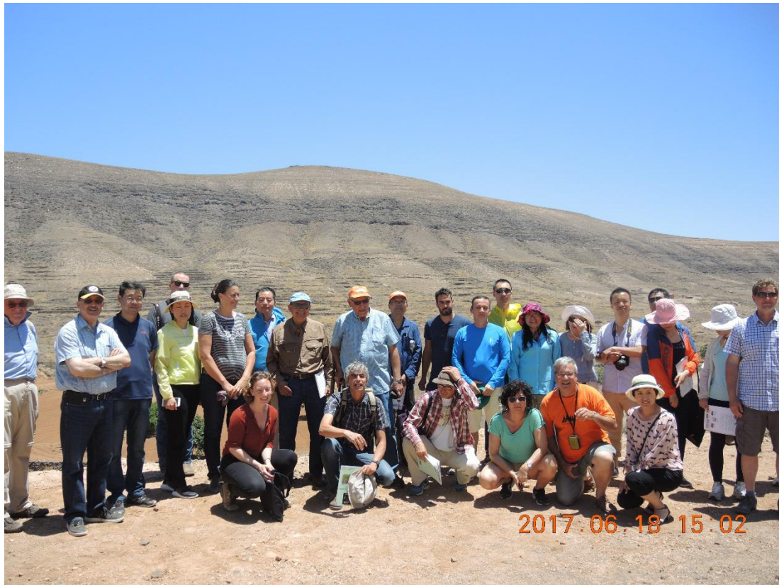
Some participants in the field trip