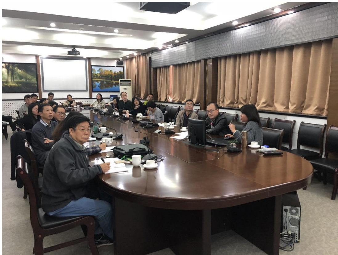
The kick-off meeting of global soil erosion evaluation