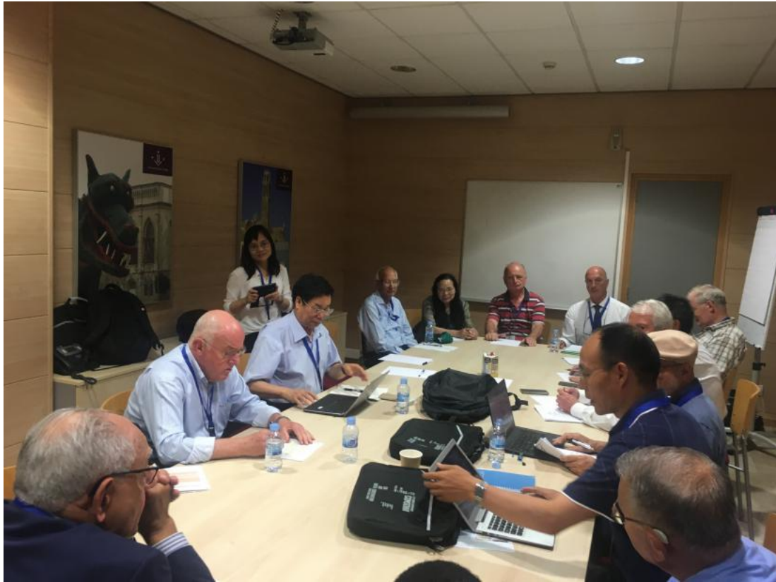
WASWAC Council meeting