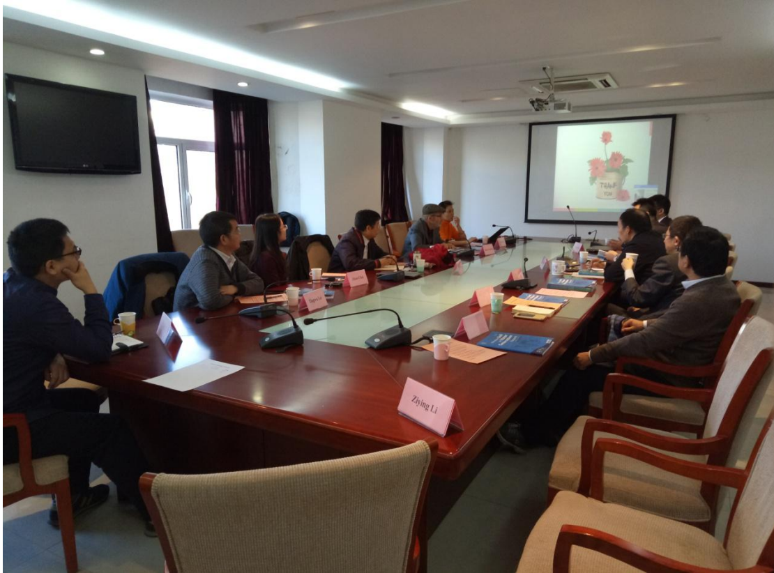
The administrative meeting of ISWCR